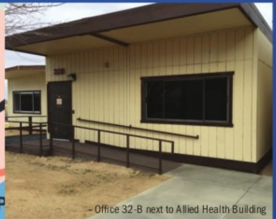
Office 32-B next to Allied Health Building