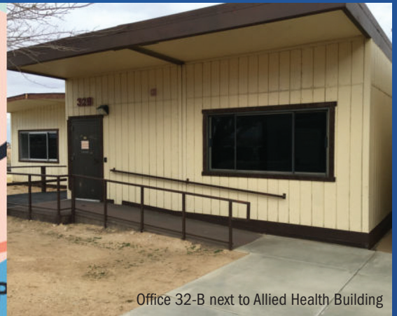
Office 32-B next to Allied Health Building