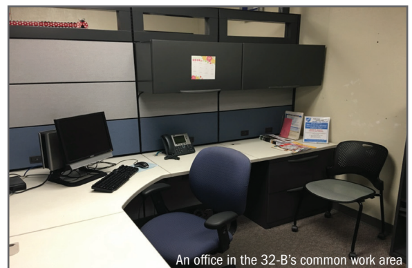
An office in the 32-B's common work area